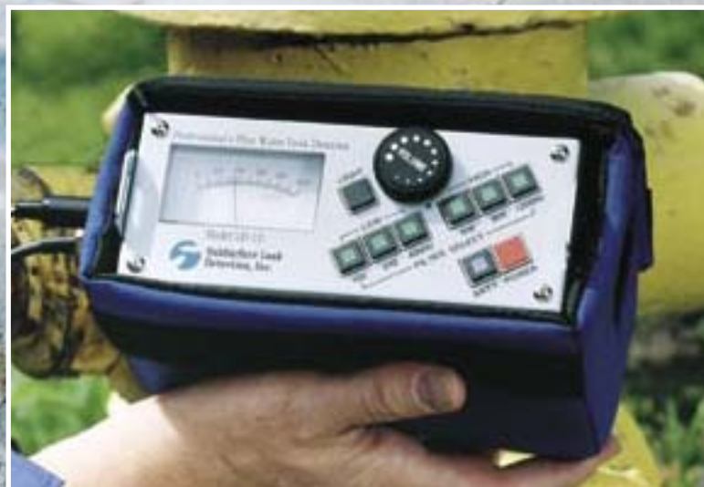
Ground Miking with the LD-12 to Pinpoint the Leak